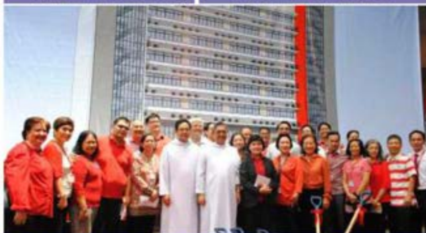
16 A New Eight-Storey Building Soon to Rise at the College Quadrangle