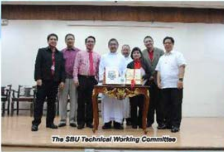
The SBU Technical Working Committee