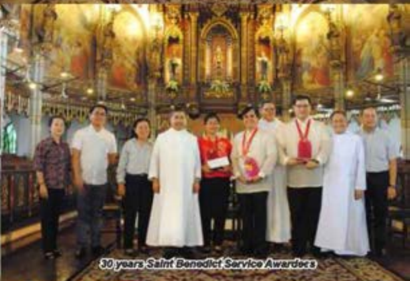
30 years Saint Benedict Service Awardees