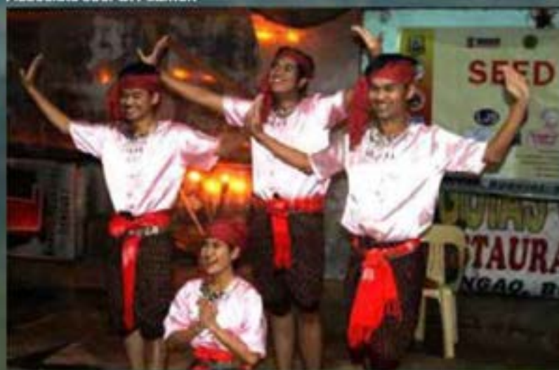
Delegates from Theksin University, Thailand perform during the Cultural Night.