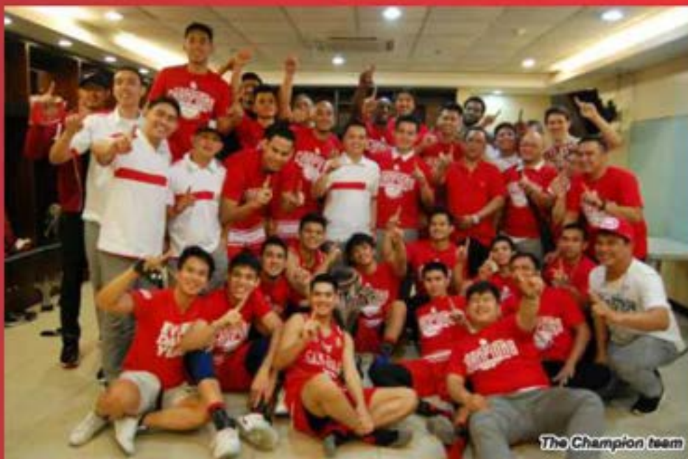
The Champion team

Redemption 2.0 is complete. As expected, the San Beda College men's basketball team successfully avenged last year's defeat with a 2-0 sweep of the Arellano University Chiefs in the 92nd National Collegiate Athletic Association (NCAA) season's best-of-three finals series. The Red Lions, who lost the title to Letran last season, annexed their 20th NCAA men's cage title, the most in the 92-year old league.