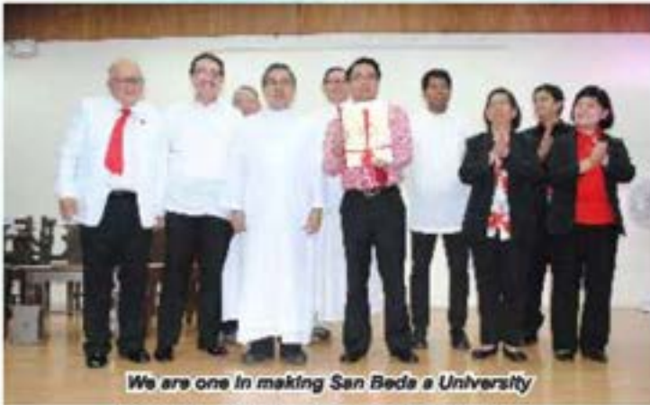
We are one in making San Beda a University