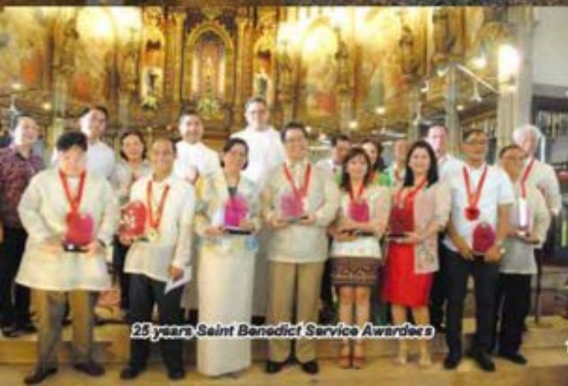
25 years Saint Benedict Service Awardees