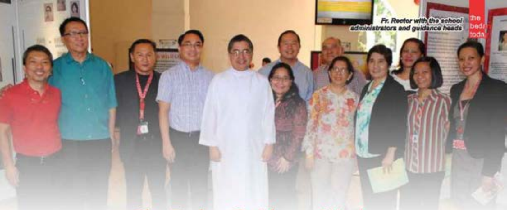
Fr. Rector with the school administrators and guidance heads