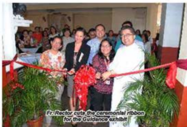
Fr. Rector cuts the ceremonial ribbon for the Guidance exhibit

Through the years, the Guidance and Counseling Office has been playing a pivotal role in realizing the school's vision-mission and strengthening our identity as a Benedictine school with a strong Bedan family spirit.