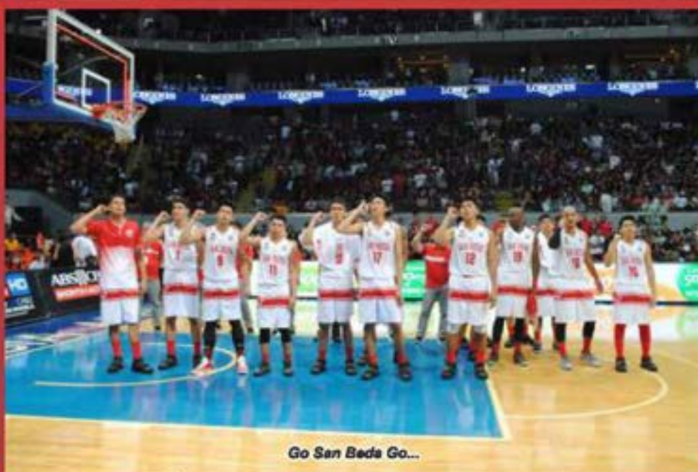
Go San Beda Go...