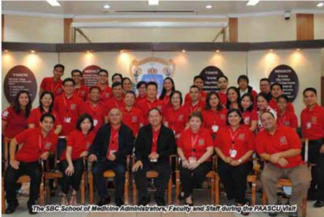
The SBC School of Medicine Administrators, Faculty and Staff during the PAASCU Visit