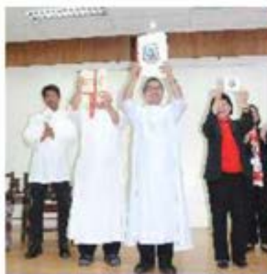
03 The Making of San Beda University