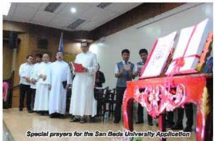
Special prayers for the San Beda University Application

Briefly, as I understand it, the differences between a College and a University lie in the number of excellent programs and course offerings, the quality of the academic and professional attainments of the faculty, their research capacity and contributions in both national and international fronts, the trend of excellence in teaching and learning methodologies, the social engagements in local and international arena, the infrastructure capabilities in both