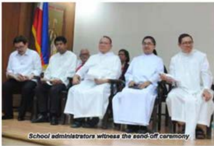
School administrators witness the send-off ceremony

Our celebration today has crafted a wonderful theme that articulates the very spirit of our gathering. The send-off ceremony reminds us that each one of us is likewise being sent to a Mission to accomplish in life. It reminds us of the first group of Spanish Benedictine fathers who were sent to a successful education mission to the Philippines. This send-off ceremony is a symbol of all of us together, moving on a journey to new frontiers, moved by the Spirit of "Ora et Labora".