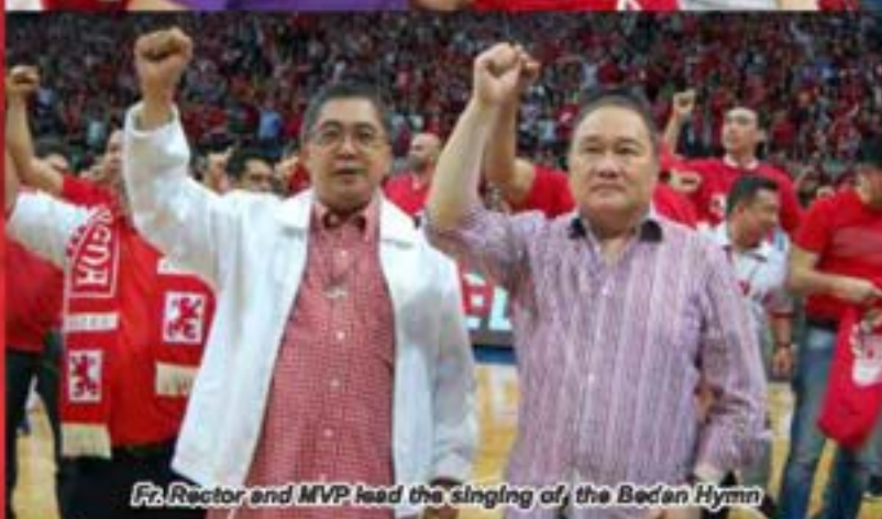
Fz. Rector and MVP lead the singing of the Bedan Hymn