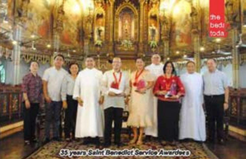
35 years Saint Benedict Service Awardees