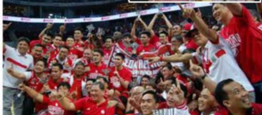
49 Red Lions take back NCAA cage crown