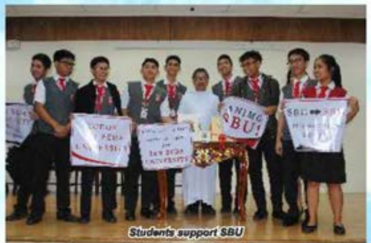
Students support SBU