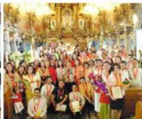
13 Saint Benedict Service Awards 2016