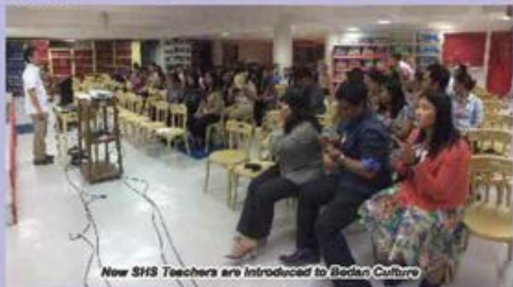
New SHS Teachers are introduced to Bedan Culture

The program for the new faculty members include a Benedictine