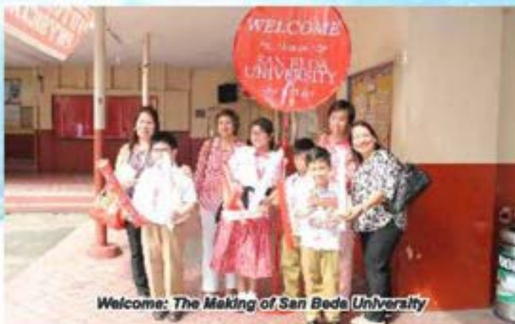
Welcome: The Making of San Beda University