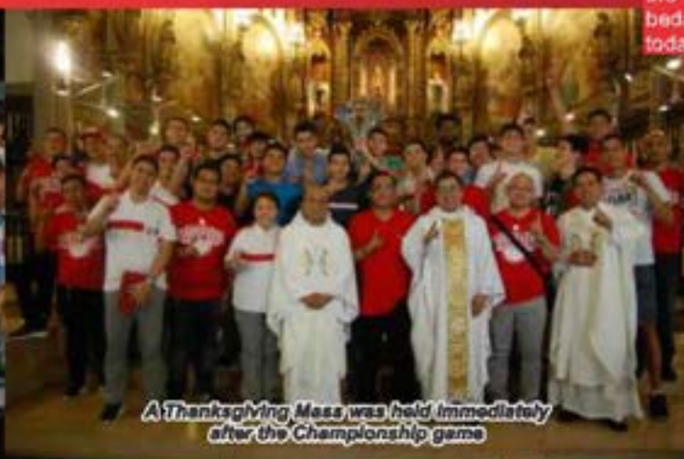
A Thanksgiving Mass was held immediately after the Championship game

digit win over the Altas to book a rematch of the 2014 NCAA finals with the Chiefs at the Mall of Asia Arena. San Beda entered the NCAA finals for the 11th straight season.