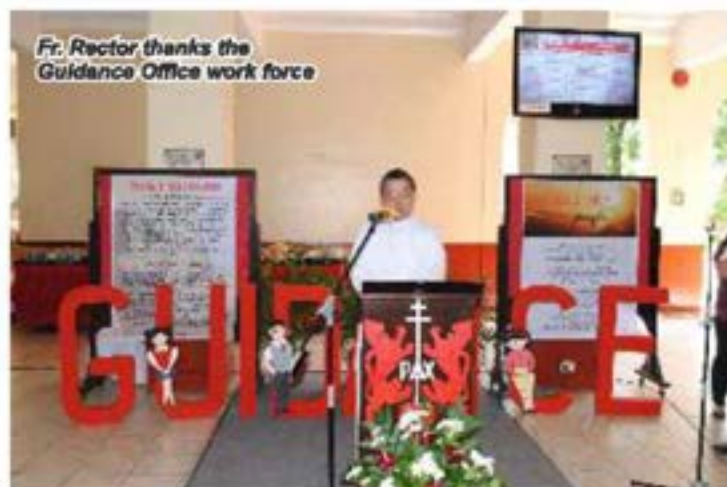
Fr. Rector thanks the Guidance Office work force