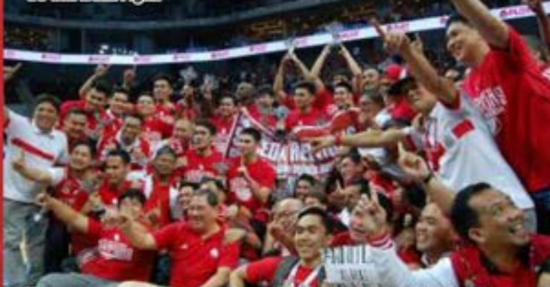
Go San Beda Fight!

The 2016 Red Lions band had the Herculean task of bringing back the NCAA plum to SBC and it did not disappoint. With a young crew, we can expect the Lions to return in 2017 with an even louder roar, and perhaps build another dynasty.