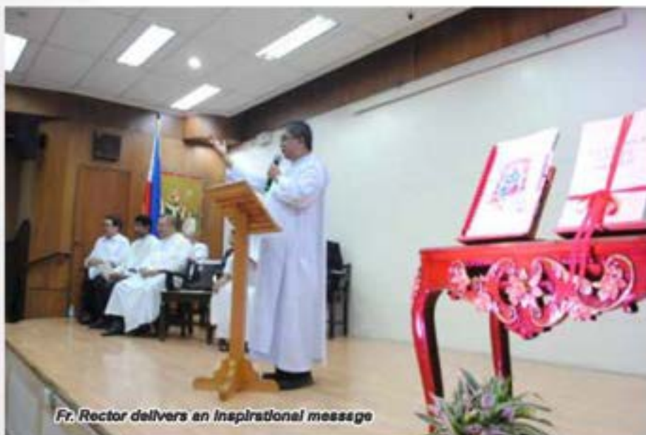
Fr. Rector delivers an inspirational message

But I am even happier and more excited, that in today's rapidly changing world, San Beda College has chosen an educational vision that is genuinely Benedictine in character, looking forward to doing more for God's glory and service to the people.