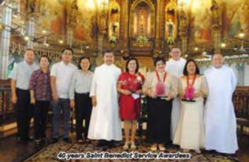
40 years Saint Benedict Service Awardees