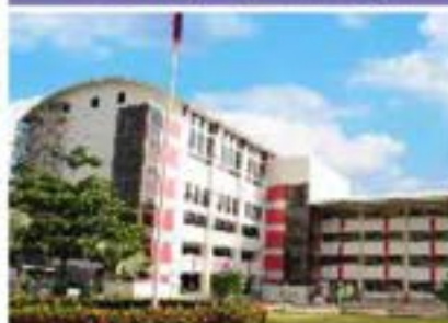
17 A New Saint Benedict Building Rise in San Beda Rizal