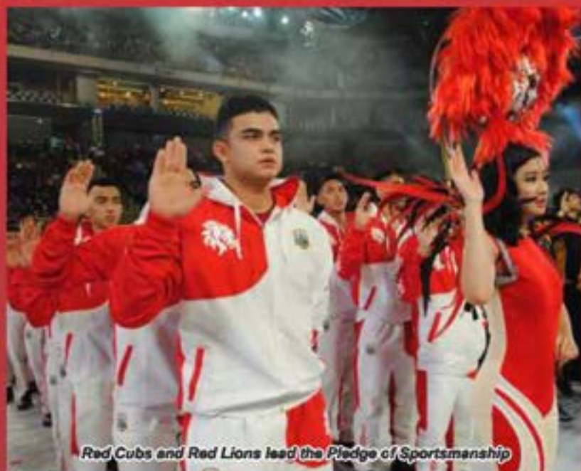
Red Cubs and Red Lions lead the Pledge of Sportsmanship