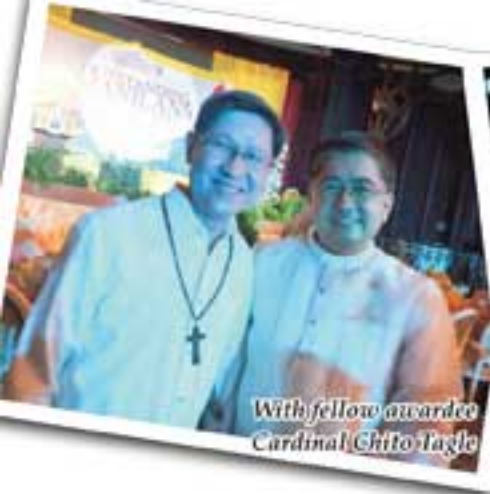
With fellow awardee Cardinal Chito Tagle