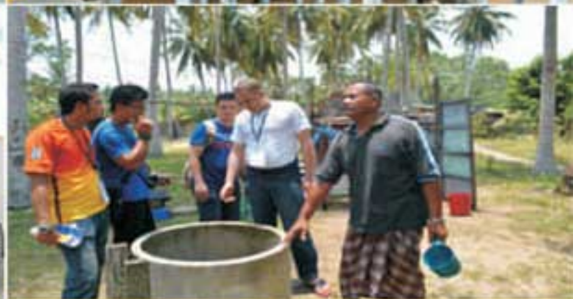
Working in Teams. The different multi-cultural and multi-disciplinary teams were gathering data through interview (below) and working on the written report (above).

which can be reached by fifteen minutes motor boat ride from the island of Pantai Suri.