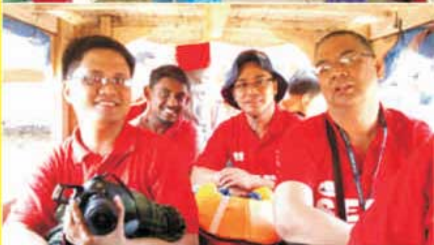
Arrival in Pantai Suri. Participants arrived in the island of Pantai Suri, Tumpat, Kelantan, Malaysia.