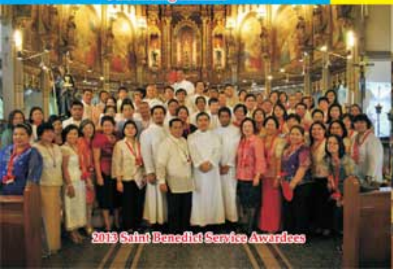
2013 Saint Benedict Service Awardees