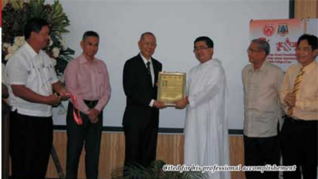
Cited for his professional accomplishment

This is the 14th professorial chair established in San Beda College, all through the efforts and initiatives of its distinguished alumni. The professorial chair is a special project program of the SBCAF aimed at assisting the faculty members improve the delivery of classroom instructions and in the furtherance of their research and community involvement pursuits.