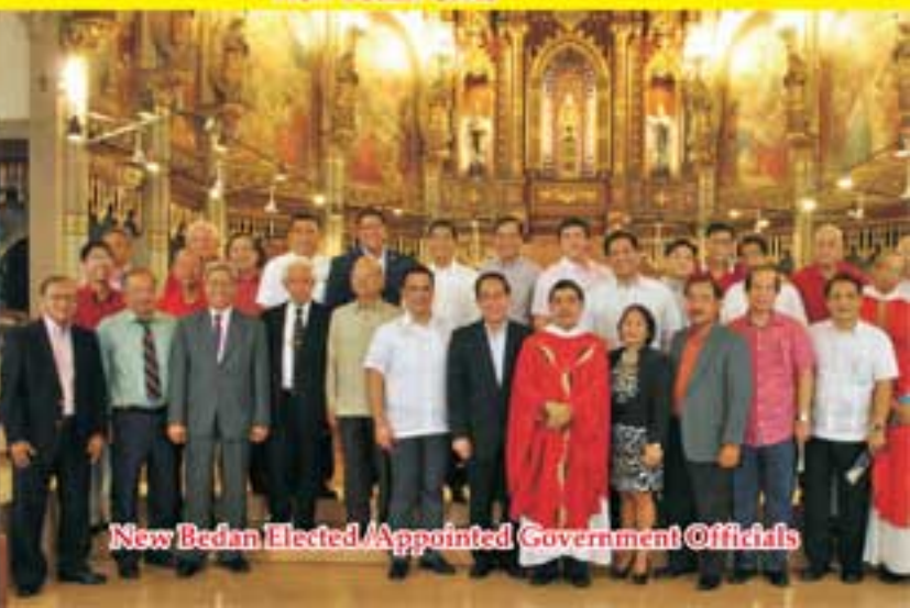
New Bedan Elected/Appointed Government Officials