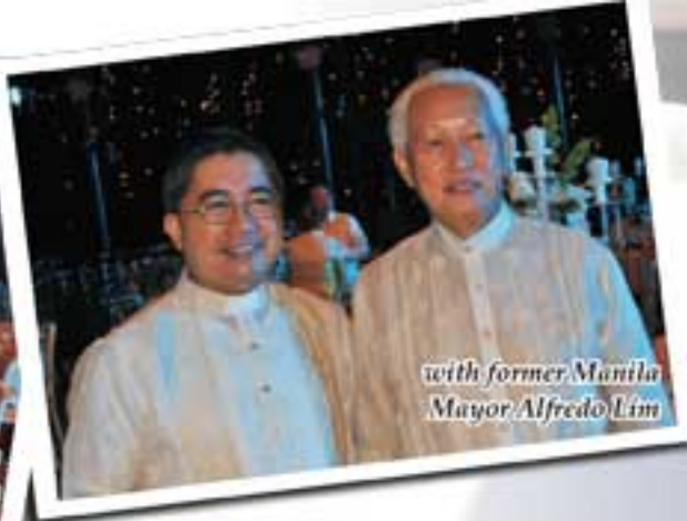
with former Manila Mayor Alfredo Lim