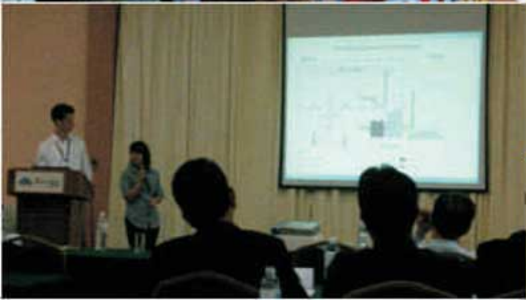
Presentation of Proposed Programs or Projects. The teams presenting their respective proposed proposals to the villagers of Pantai Suri and Teluk Rejuna (top) and to the government officials and representatives from the business and banking sectors (bottom).