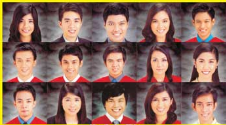
New Bedan CPAs