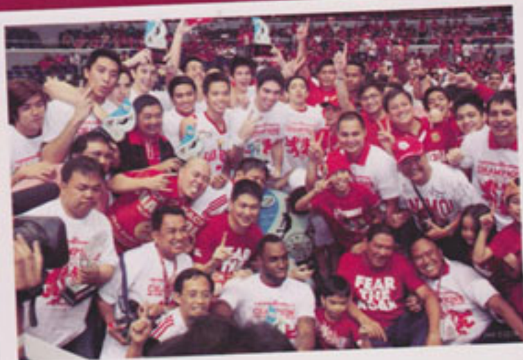
San Beda Red Lions