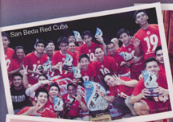
San Beda Red Cubs