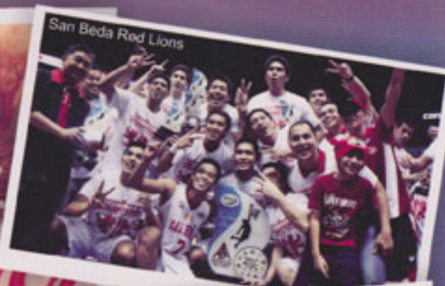
San Beda Red Lions