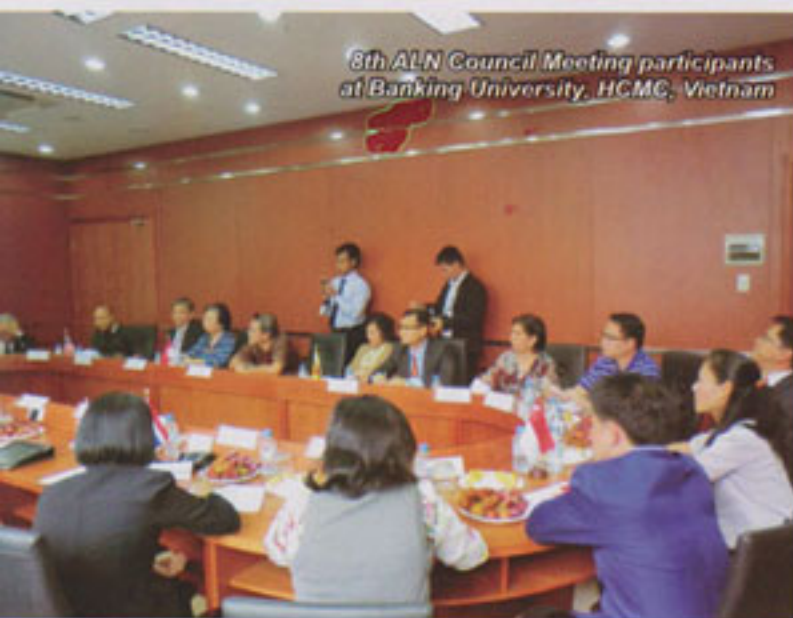
8th ALN Council Meeting participants at Banking University, HCMC, Vietnam

April 13-16, 2011 hosted by the Banking University, HCMC, Vietnam with 9 participating institutions from 7 countries