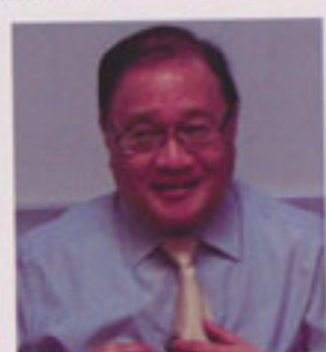
Dr. Manuel V. Pangilinan