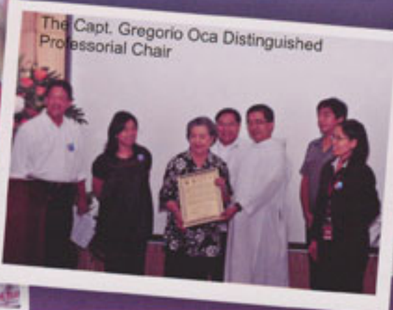
The Capt. Gregorio Oca Distinguished Professorial Chair