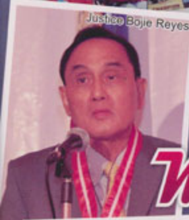
Justice Bojie Reyes