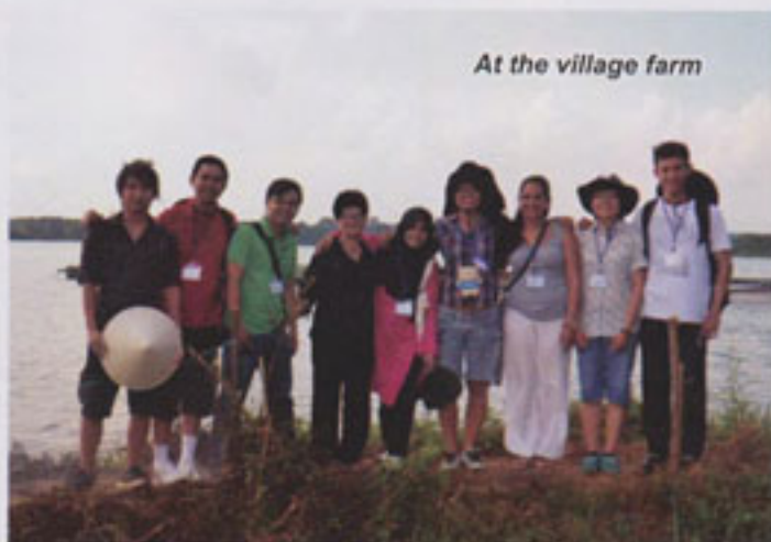
At the village farm

In addition to the SEED Program, identified opportunities for SBC linkage with ALN member and observer institutions (University of Parahngayan, Indonesia; University of Malaysia, Kelantan; Prince Songkla University, Thailand; University of Brunei Darussalam; and Banking University, Vietnam, De La Salle University, Manila Philippines) are in the areas of joint research, publication, faculty and student exchange, and the conduct of international conference.