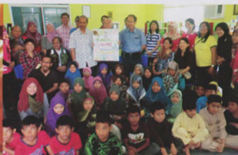
At Kampong Bolkiah Water Village, with ALNC participants UBD faculty, students in their Library reading project site for the Village children