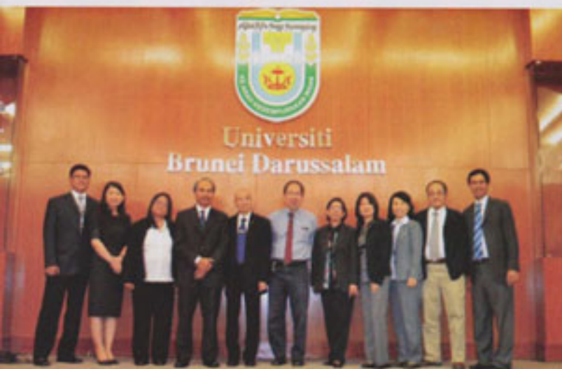
9th ALN Council Meeting participants at the University of Brunei Darussalam

The University of Brunei Darussalam in turn brought the participants to their community outreach projects in the water village at Kampong Bolkiah and Ayer. The faculty and students are involved in the following: 1) Library/reading project for the children; 2) fish sausage and kropeck project; and 3) weaving project for women,