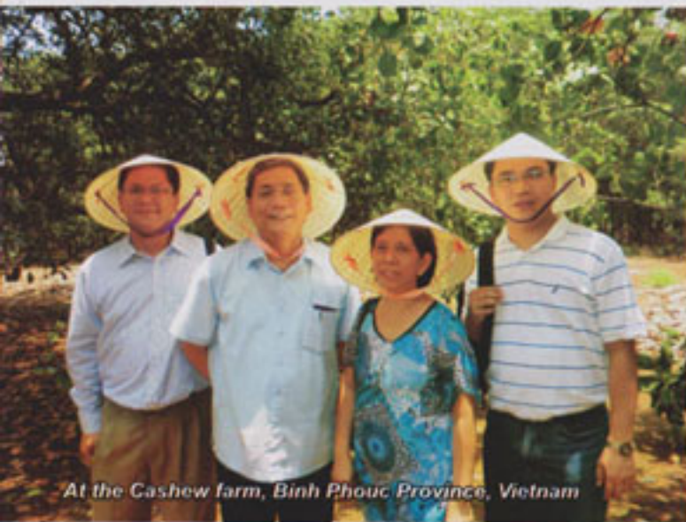
At the Cashew farm, Binh Phouc Province, Vietnam

Possible research topics and other areas for collaboration were identified during the said Council meeting. The following activities were also agreed upon by the members: