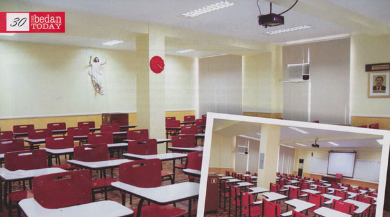
The Dean Ramon Ricardo Roque Graduate School of Business Room – “A first-of-its-kind in SBC”