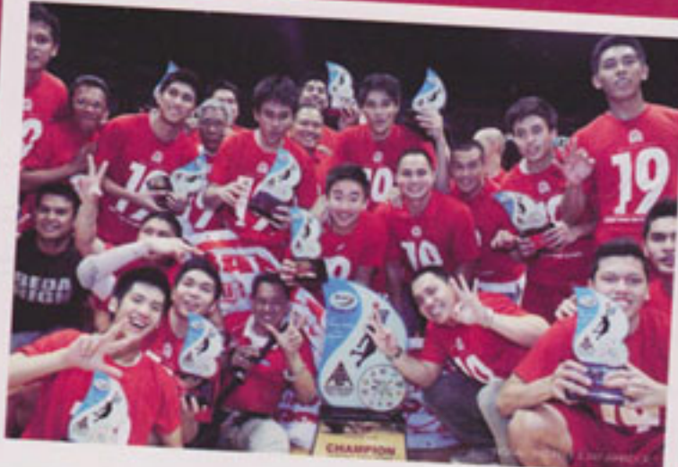
San Beda Red Cubs