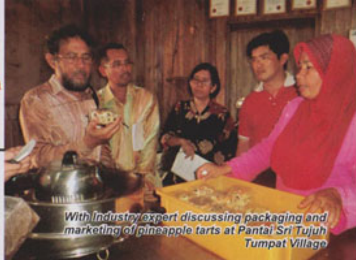
With industry expert discussing packaging and marketing of pineapple tarts at Pantai Sri Tujuh Tumpat Village