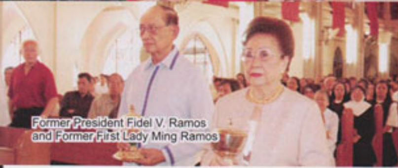
Former President Fidel V. Ramos and Former First Lady Ming Ramos