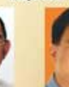
Justice Marc Chiquito