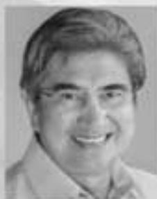
Gringo Honasan III