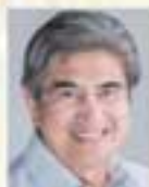
Gringo Honesan II