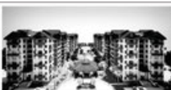
Escalades South Water Surat, Mindanao City