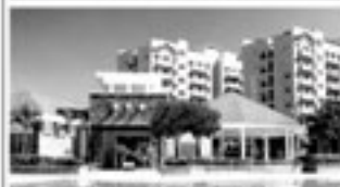
Woodville Mansions Marikina, Parañaque City