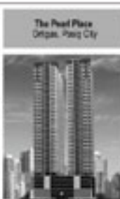
The Pearl Place Ortigas, Pang City