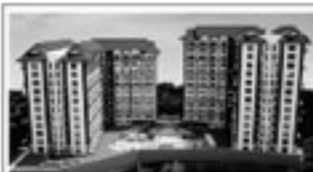
Acacia Escalades Calle Industria, Pang City