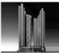
Aqua Residences Pinaric, Marikina City