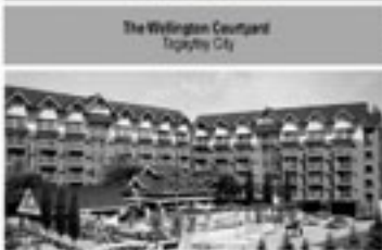
The Wellington Courtland Taguig City