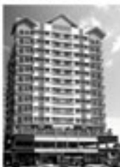
Escalades at 28th Avenue East Tower Cebu, Quezon City