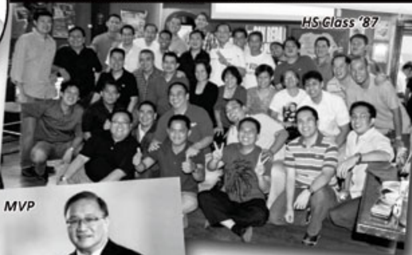
HS Class '87