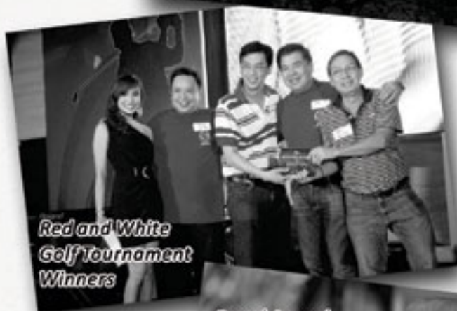
Red and White Golf Tournament Winners