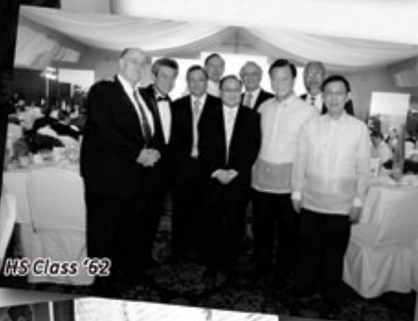
HS Class '62