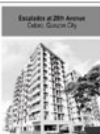
Escalades at 28th Avenue Cebu, Quezon City