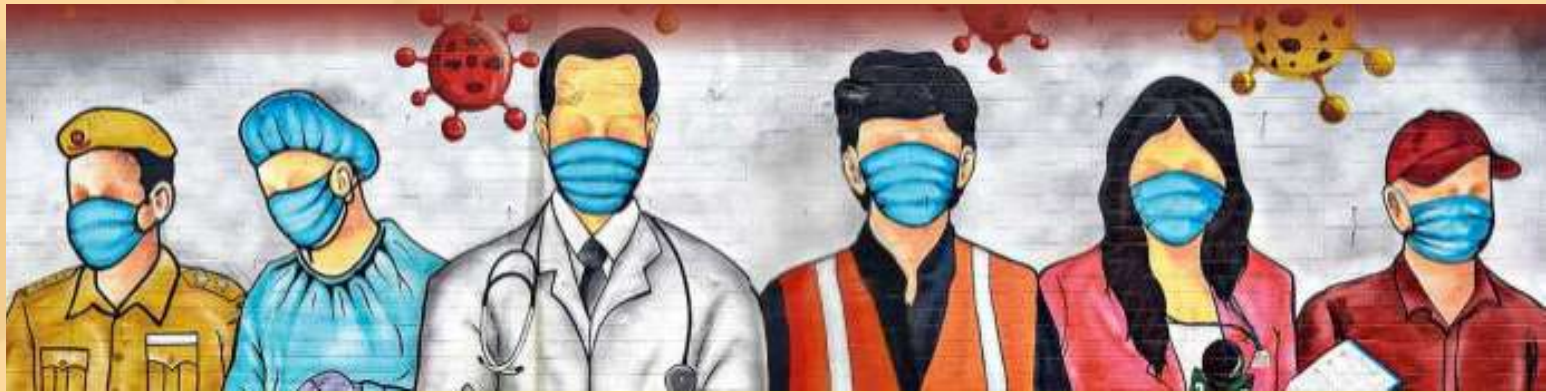
Volunteering in New Normal