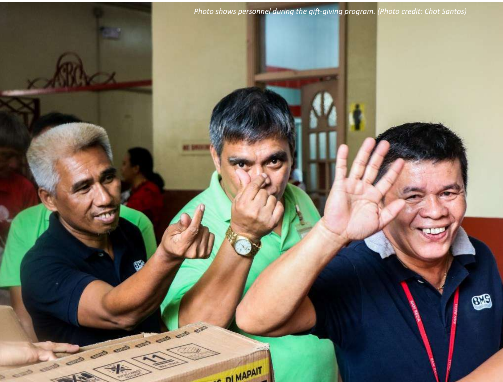
Photo shows personnel during the gift-giving program.

In conclusion, these gifts are expressions of love and appreciation between the university and its stakeholders - a tangible evidence of the noble bond and common values that bind them together.