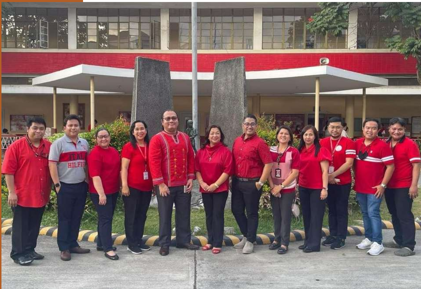
Photo shows administrators and faculty of the College of Nursing

When all is said and done, the output is much more than a trophy. It is a tapestry of excellence.