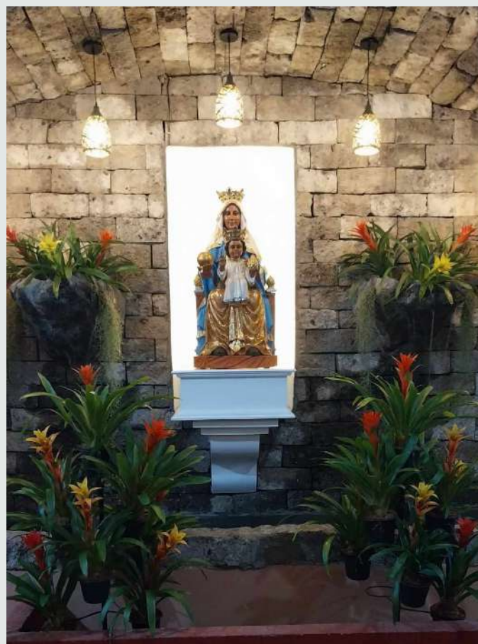
The grotto of Our Lady of Montserrat, strategically located at the side of the building, is seen to elevate the consciousness of the presence of Mary in the life of Bedans.

Seventh Floor: I. T. Services and Development Office Mac Laboratory Computer Laboratory A Computer Laboratory B Open Laboratory CAS Business Laboratory Networking Laboratory