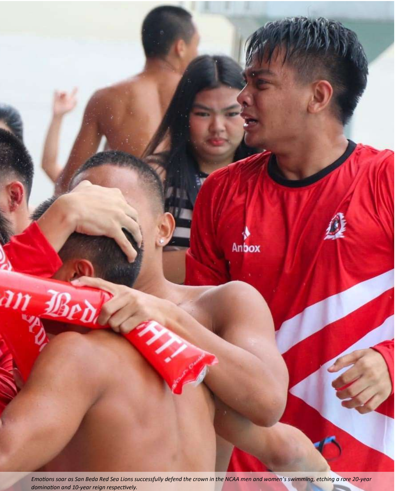
Emotions soar as San Beda Red Sea Lions successfully defend the crown in the NCAA men and women's swimming, etching a rare 20-year domination and 10-year reign respectively.