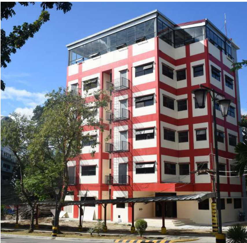
Photo on top shows the new athletes' quarters in Rizal campus.

In a celebration that fuses athleticism with Benedictine spirituality, the new athletes' quarters in Rizal campus witnessed a unique ceremony, as the new building was blessed and dedicated to the revered Holy Child on January 25, 2024, the opening day of the Pista ng Santo sa San Beda 2024. The dedication