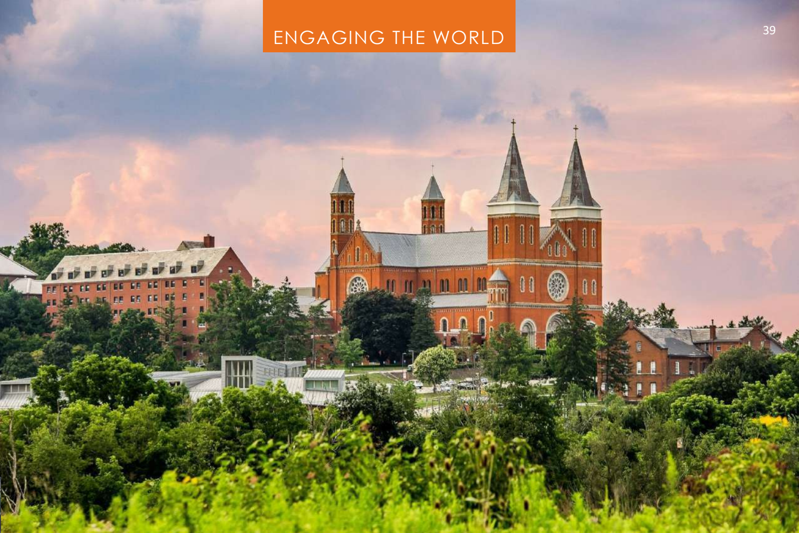
Photo shows Saint Vincent College in Latrobe, Pennsylvania, USA.