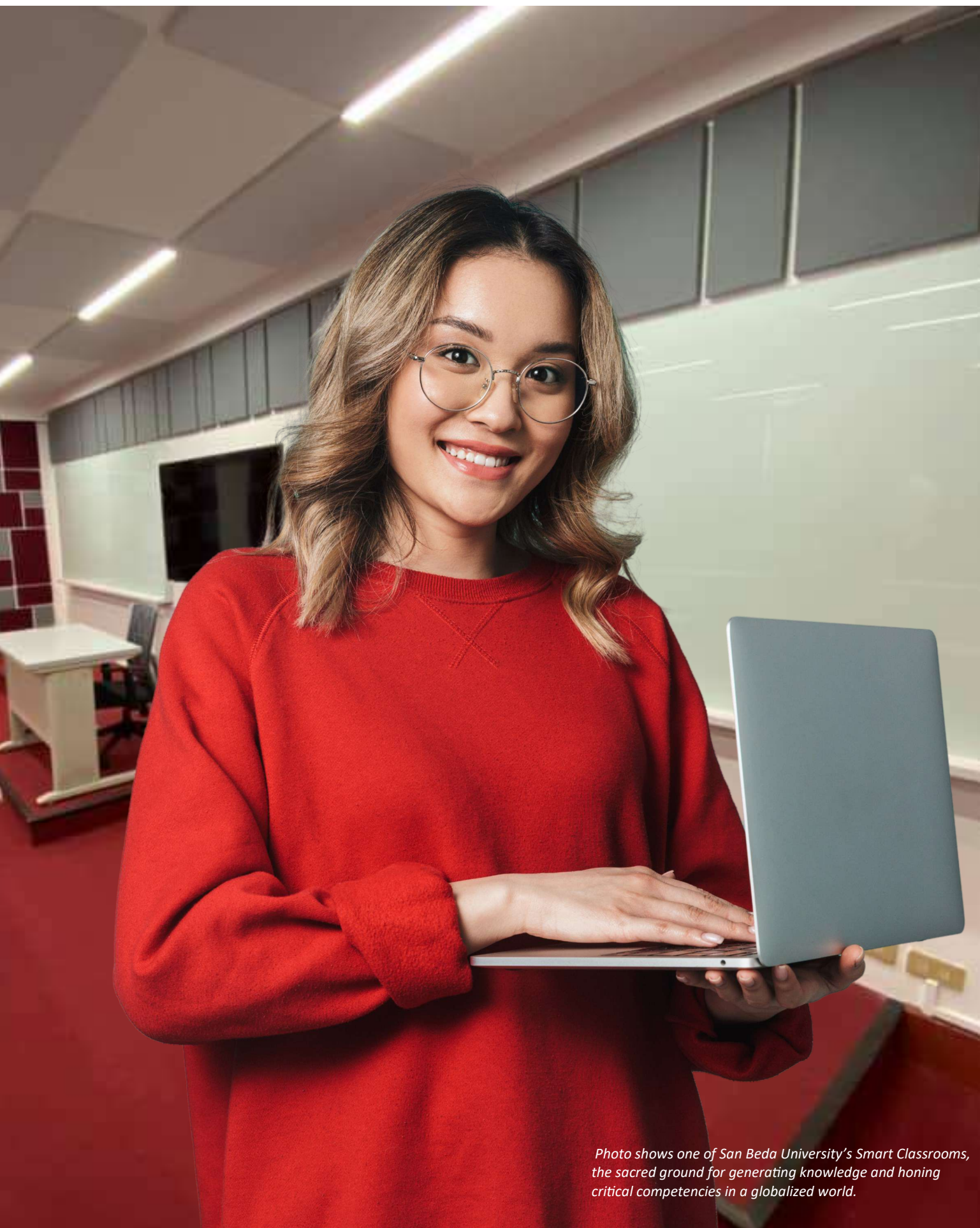
Photo shows one of San Beda University's Smart Classrooms, the sacred ground for generating knowledge and honing critical competencies in a globalized world.